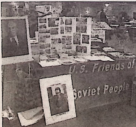
USFSP table at Left Forum