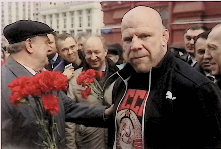
Monson is hoping to master Russian so he can eventually become a communist deputy in the State Duma.

“The only way we are going to survive as a species is to share things, stopping production of things we don’t need. Produce for need, instead of capital and wealth,” Monson told The Moscow Times .