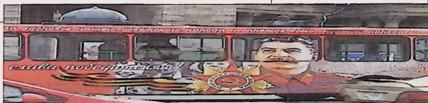
2011 MOSCOW BUSES HONOR STALIN'S ROLE IN WW II

Saturday, November 19 @ 2 pm Niebyl-Proctor Marxist Library for Social Research 6501 Telegraph Ave., Oakland (Wheelchair accessible)