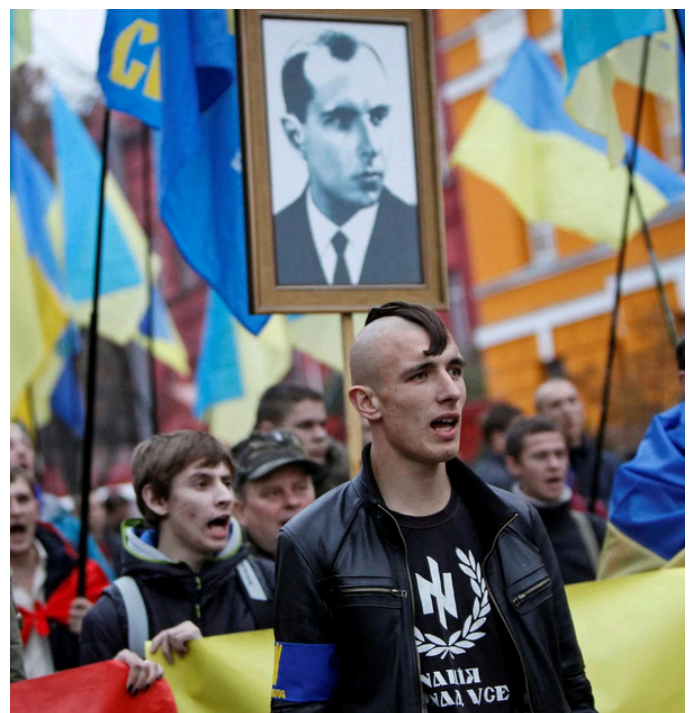
Youth born after 1991 (the temporary demise of the USSR) march in Kiev for Ukrainian fascist Stepan Bandera.

Long live the solidarity of working peoples and nations in the struggle against Fascism! ¡No pasarán! They shall not pass!