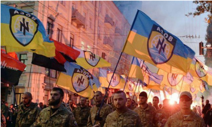
Neo-Nazis march in Ukraine with fascist flags of the Azov battalion and the infamous "blood and soil" flag.

Donbas and Lugansk citizens rose up in a liberation struggle against neo-Nazism. Western governments, led by the United States, began pumping Bandera Ukraine with weapons. Zelenskyy already says he wants to have the nuclear weapons, and NATO has failed to stop his drive for war. On the contrary, NATO says it is prepared to transform the Ukrainian army with new weapons. And the imbecile leaders in Washington and London are ready to give depleted uranium shells to the neo-Nazi regime in Kiev.