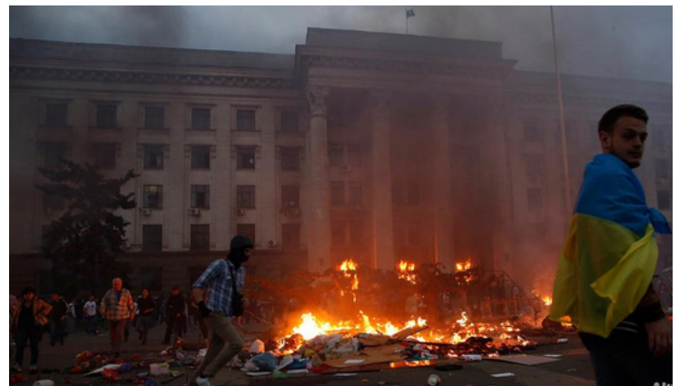
Odessa Trade Union House on fire 2014 by Nazi elements in the Euromaidan Coup. About 50 trade unionists were trapped and murdered.

For many years, the followers of Ukrainian fascist Stepan Bandera have been tormenting the popular masses. They have turned Ukraine into a concentration camp for dissenters, shut down media outlets they do not like, banned opposition activities and launched persecution of communists. The Kiev regime targets all those who have preserved the ideal of Socialist Brotherhood of Peoples and loyalty to the Great Soviet Victory over Fascism. These fascist Ukrainians burned trade unionists alive in the Odessa Trade Union House of Labor. Year in and year out the fascist Azov thugs have killed and wounded civilians in the Donbas region.