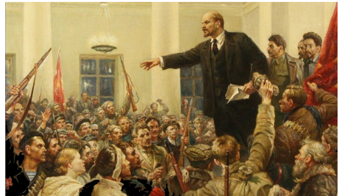
Lenin addressing the Soviets

We act as a unifying front but are not a forum for ideological debates. The people of the Soviet Union and Eastern Europe will choose their own paths towards socialism.