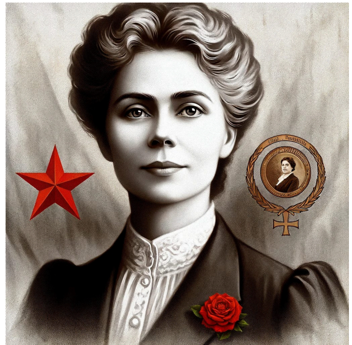
Soviet Ambassador Alexandra Kollontai, Order of Lenin Recipient for work among women

Over 33 thousand women are working in laboratories and in research institutes, 25 thousand women have academic